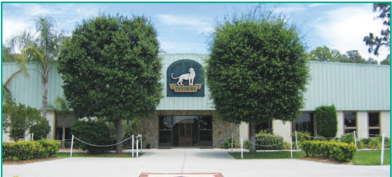
The Genesis Preparatory School gymnasium building

In the admissions process, consideration of applicants is given equally, regardless of race, gender, creed, and national or ethnic origin. Students from all over the world are welcomed and are fully integrated into the Genesis family.